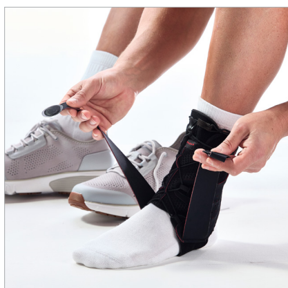
Figure-8 straps provide inversion/eversion control