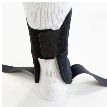
Step-in design makes donning and doffing quick and easy