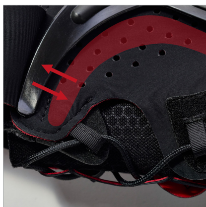
Anatomically contoured bilateral stays provide additional stability and protection and can be repositioned to accommodate the malleoli