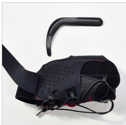
Modular design means the support can be adapted easily for acute or chronic use by removing the stays