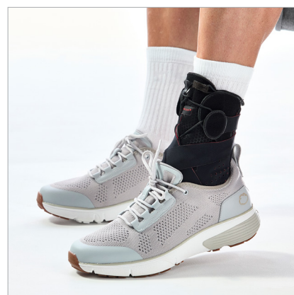
Fits inside a trainer comfortably allowing patients to stay active