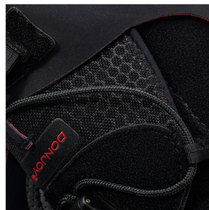
Lightweight, breathable fabrics help the foot stay cool and dry to aid compliance