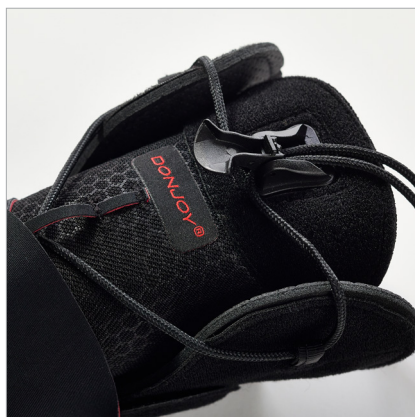
Secure lace-locking mechanism enables precise tightening, helps maintain a consistent fit, and allows quick release